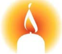
Compline Worship Service