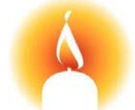
Compline Worship Service

Last month I shared with you a quote from Pastor Tim Keller, "Religion is being proud of what you have done. The Gospel is being proud of what Jesus has done." Our text from Galatians finds the people of God wrestling with just this notion. Are we proud of Jesus or ourselves?