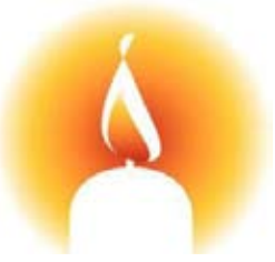
Compline Worship Service

The Fourth Wednesday of the month Jan. 24 at 7:00